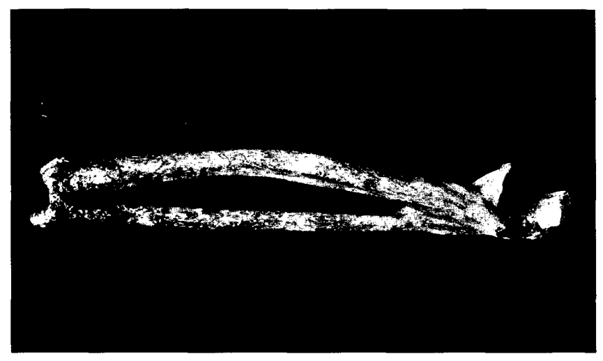
Fig. 4. Left Forearm Bones from Short Cist at Kilspindie Golf-course, showing Fission of Radius and Ulna at Elbow-joint.

corresponding measurements of the shaft of the right ulna are 15 mm. by 10 mm.