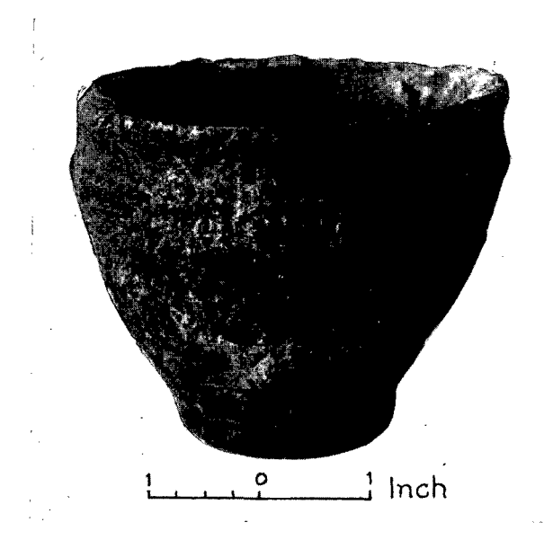
Fig. 1. Food-vessel from Kilspindie Golf-course.

transverse bands of nearly similar width, showing a long oblique fracture with a very acute angle on the top and bottom edges, the upper fracture being on the inside and the lower on the outside. During the last ten years more than twenty examples of the four types of our Bronze Age urns have been received into the Museum in a more or less broken condition, but not one of them showed the consistent, oblique, acute-angled fracture of the Kilspindie specimen. It would thus appear that this unusual break is the result of the peculiar method of building up the vessel. The basal part having been modelled, the