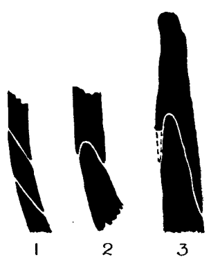
Fig. 2. Sections of Walls of Urns, showing methods of manufacture. (½ ca.)

of a vessel found in the earth-house at Skara Brae, in Orkney, in the 1928 excavations, only in this case the joint appears 1 inch below the rim. As only a small part of the vessel has survived, it is impossible to say how many sections had been required to complete the wall, but the two upper strips can be seen clearly, their combined width being 3½ inches. The joint in this case combines the long oblique overlap of the Kilspindie vessel with the rounded edge inserted in a groove as in the Longniddry urn (fig. 2, No. 3). In the third example a vessel found in the crannog in the Bishop's Loch, a few miles east of Glasgow, about twenty-five years ago, showed that the wall had been built up by winding bands of tough clay spirally towards the