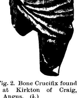
Fig. 2. Bone Crucifix found Angus. (1.)

Pair of Polo Sticks, used about 1875 by the Luffness Polo Club.