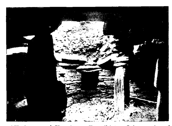
Fig. 2. Interior of Underground Chamber at Rennibister, Orkney, viewed from Entrance Passage, showing Ambry in East Wall.

passage, and thus lying roughly north-west and south-east. It is, as nearly as one can gauge it, 11 feet 3 inches long by 8 feet 5 inches broad at the widest part. The roofing is effected in the fashion usual in such ancient structures, by overlapping stones. In this type of building, however, the span is too great to be covered wholly in that way without further support, and hence in this chamber are four pillar-slabs, arranged in a rough square, and standing free—each rather over a foot out from the nearest wall-face. Large lintels, extending inwards from the converging walls, are supported on these pillar-slabs, and though the bulk of the central portion of the roof has collapsed, it has doubtless been domed over by further series of overlapping flag-