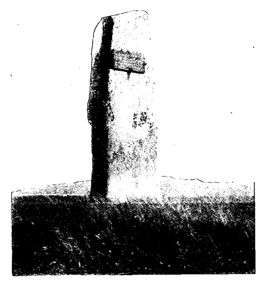
Fig. 5. Nelson's Monument, Taynuilt, Argyll.

iron-workersjat the Lorn furnace, then in full blast at that place, marched in a body to Barra na Cabar, mounted the four-ton block on wooden rollers, and dragged it a mile eastward to a prominent knoll called Cnoc Aingeal (knoll of the fire), and there raised it—the first monument to Lord Nelson in the British Isles (fig. 5). With nearly 12 feet of its