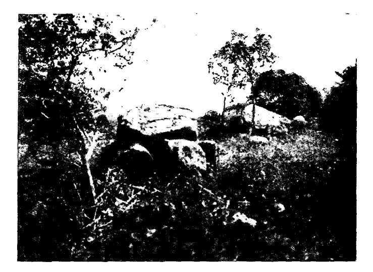
Fig. 2. Denuded Chambered Cairn, showing the two Chambers at Achnacree Beag, Argyll.

Of these venerable monuments Dr Smith, in the paper specified (p. 99), writes:—"Two memorials of ancient times on the farm of Achnacridhe beg. They are cromlechs ( sic ) I suppose." He continues on the next page, "They are megalithic structures, the largest and most easterly has ten large boulder stones arranged somewhat in form of a grave. These have over them two large blocks of granite; one has slipped off the boulders a little. Each may be about a couple of tons weight. The smaller cromlech is only a few paces to the west of the larger. It consists of five large boulders with one large mass on the top. The use of five and ten is worth remarking. Around these cromlechs there is a circle of small