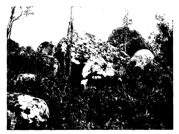
Fig. 4. Chambered Cairn at Achnacree Beag, Argyll-east chamber.

The greater or east chamber (fig. 4) has suffered more than its companion. Seven supporting blocks (not ten, as stated by Dr Smith) remain in situ , though it is probable that an eighth (seen in the foreground of our illustration) filled the vacant space where the young ash is growing. This chamber is 4 feet 9 inches from north to south by 8 feet from east to west, internal measurement, and has been at least 4 feet in height. A peculiar feature is the building by means of small rounded boulders wedged firmly in earth between and within the pillar masses evidently to