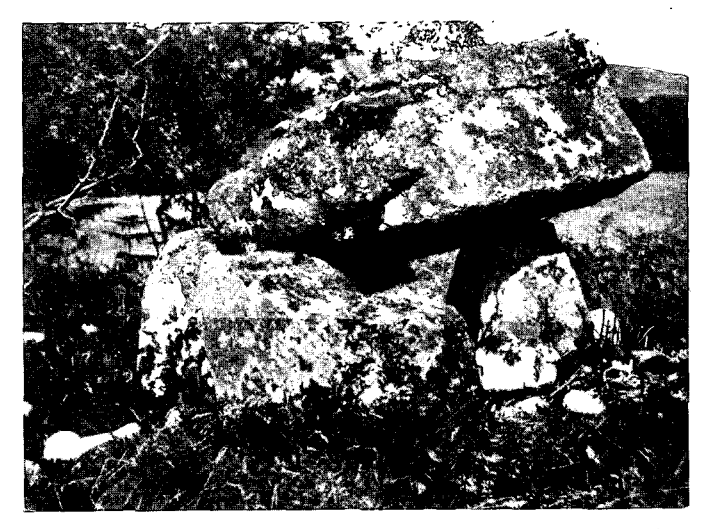
Fig. 3. Chambered Cairn at Achnacree Beag, Argyll-west chamber.

There are two burial chambers, 35 feet apart, measuring from centre to centre, and this line shows the orientation to be north-west and southeast—not due east and west. Twenty-five feet out from each centre a rude peristalith is clearly traceable, formed of rounded boulders from 12 to 18 inches diameter and correspondingly high. Thus, the longer axis