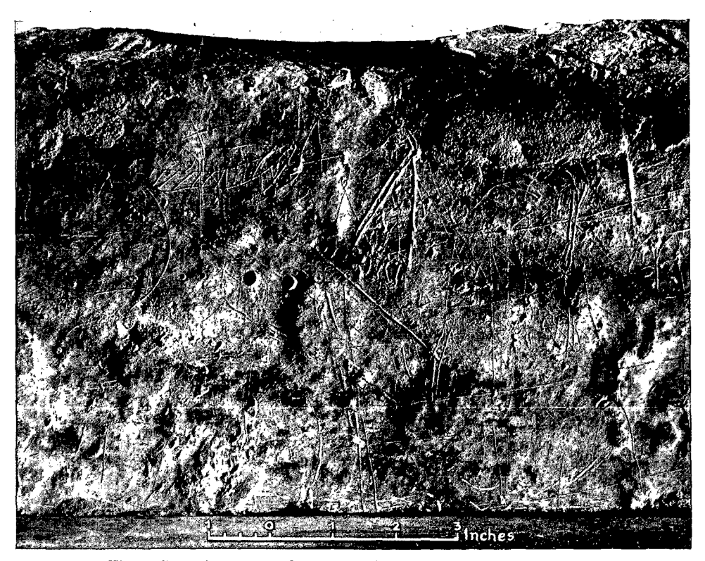
Fig. 1. Central portion of Sculptured Slab from the Broch of Burness.

The stone itself (fig. 1) is a most curious and puzzling relic. It measures 40 inches in length, tapers slightly in breadth from 8 inches at one end to 6 inches at the other, and in thickness it tapers also from about 2\frac{1}{2} inches at one end to about 1 inch at the other. It is of the dark grey or blue stone (Old Red Sandstone) which is so commonly seen on the Orkney beaches. Only one face shows any signs of human workman-