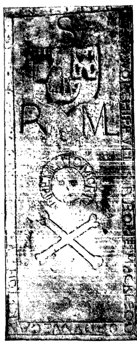
Fig. 4. Arms on Rory Mor's Tombstone.

These facts are in my opinion amply sufficient to displace the probabilities which were erroneously accepted by Professor Macpherson as facts. It is only fair to the memory of a learned and enthusiastic