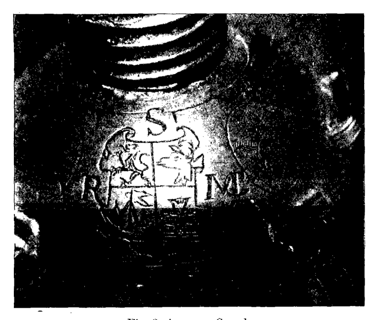
Fig. 3. Arms on Gourd.

it is important to note that whereas the identical coat depicted on the cups appears on Sir Rory Mor's gourd and part of the coat appears upon his tombstone (fig. 4) in Fortrose Cathedral ( Proceedings , vol. xlvii. p. 118), one cannot find in document, sculpture, or plate in the possession of the MacLeods of Talisker any of the arms displayed on the cups. On the contrary, it can be proved by the evidence of seals and an examination of Sir Roderick MacLeod of Talisker's tombstone in Eynort Churchyard,