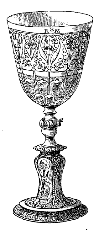
Fig. 1. Duirinish Communion Cup.

On the 16th of June 1886 an interesting and valuable paper, entitled "Notice of Communion Cups from Duirinish, Skye (fig. 1), with Notes of other Sets of Scottish Church Plate of which Specimens were Exhibited,"