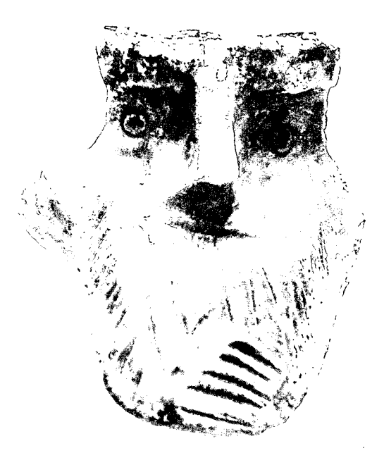
Fig. 1. Pottery Mask from Bass of Inverurie.

The Bass is a mound, in shape a truncated cone, about 50 feet in height, which occupies a strong position on the right bank of the Ury, close to the southern end of the royal burgh of Inverurie, and at the open end of a loop formed by the junction of that stream with the Don, the two