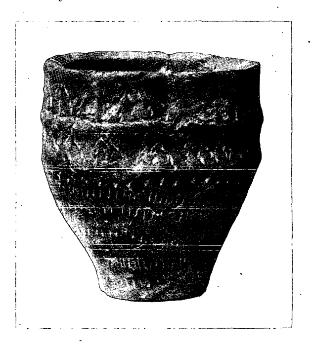
Fig. 2. Food-vessel Urn found at Sheriffton.

The best preserved urn has been restored, and it belongs to a wellknown sub-type (fig. 2). Its mouth is wide, its upper part nearly vertical, and its lower half tapers to a narrow base. Two raised mouldings or cordons encircle the vessel, one at the shoulder 21 inches below the lip, and the other midway between the rim and the shoulder.