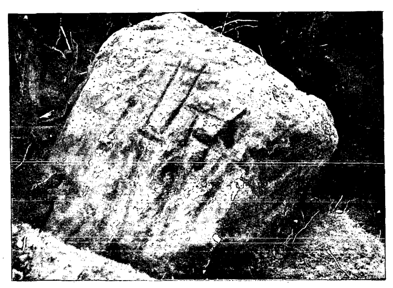
Fig. 4. Grooved Stone found at Sheriffton.

Except on sites of ancient inhabitation, it is very seldom that the discovery of four ancient deposits falls to be noted within such a