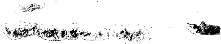
Fig. 3. Fragments of Single-edged Sword from the Viking Grave-mound at Millhill, Lamlash.

The sax, or single-edged sword (fig. 3), is of the longer variety. The existing remains of the blade have a straight length of 490 mm. until the portion is reached which shows that it has been doubled; of the