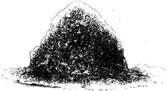
Fig. 1. Umbo or Shield-boss of Iron from the Viking-grave Mound at Millhill, Lamdash.

object on the under portion of the flange. This bolt, if for convenience we may so term it, its nature and purpose being equally obscure, has no appearance of an object accidentally having become rust-attached to the