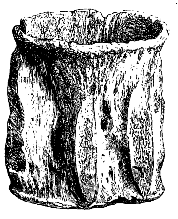
Fig. 2 Bone Cup from the Broch at Burray, Orkney.

Observing some bones and bits of clay vessels among the ashy soil we made use of the only implement at hand—a geologist's hammer—and scraped inwards about two feet, disclosing many more fragments of clay vessels, animal bones (unburnt), and some small stones which had been exposed to the action of fire. Here we came to several large stones, that might have either been detached from the rocks above or been thrown up by the action of the waves before the soil had been deposited, and in a cavity between two of these stones was discovered the bone cup standing upright on its bottom. The cup contained a small quantity of earth but was not buried in the soil, as it had to some vol. XLIII. 12