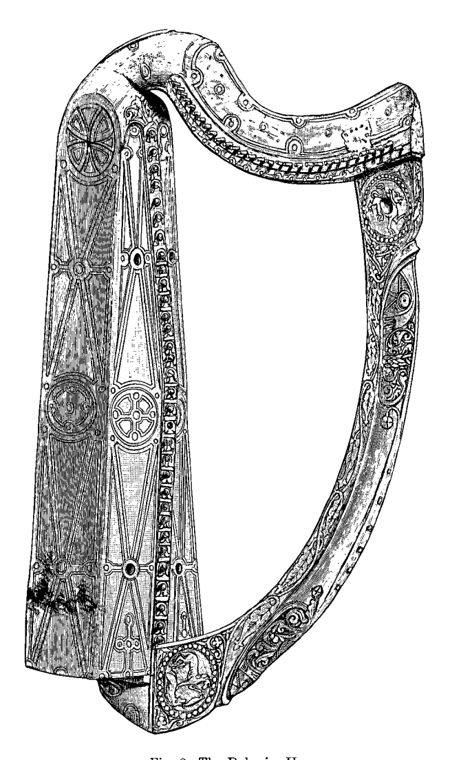
Fig. 2. The Dalguise Harp.