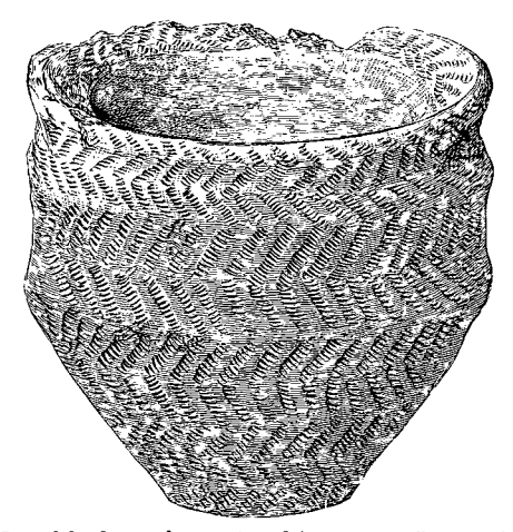
Fig. 1. Urn of food-vessel type found in a cist at Rosemarkie. (3.)

Urn, of food-vessel type, from a cist at Rosemarkie. The urn (fig. 1) is 6 inches in height and 6½ inches in diameter across the mouth,