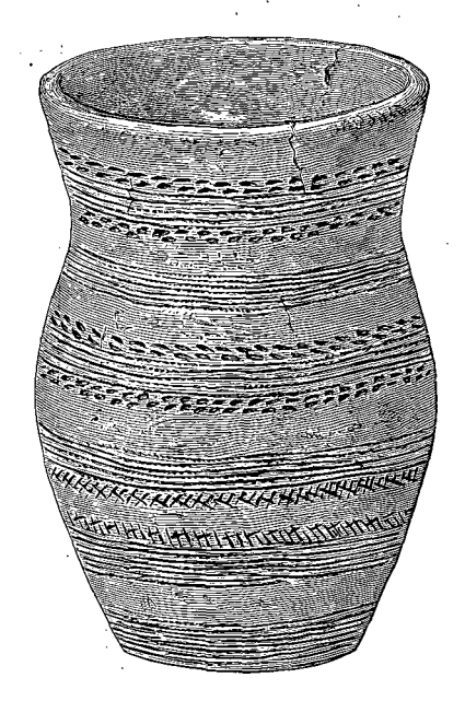
Fig. 1. Urn of Drinking-cup type from a cist at Eastbarns. (\frac{1}{3})

Enamelled Bronze Pin, found in the island of Pabbay, Barra. This pin (fig. 2), which is 5\frac{3}{4} inches in length, is of the same type as the two silver pins found at Norries' Law, near Largo, Fife, and a shorter pin of bronze (fig. 3), which also has the head enamelled, found at Urquhart, Elginshire ( Proceedings , vol. vii. p. 7, and vol. x. p. 359). Another of