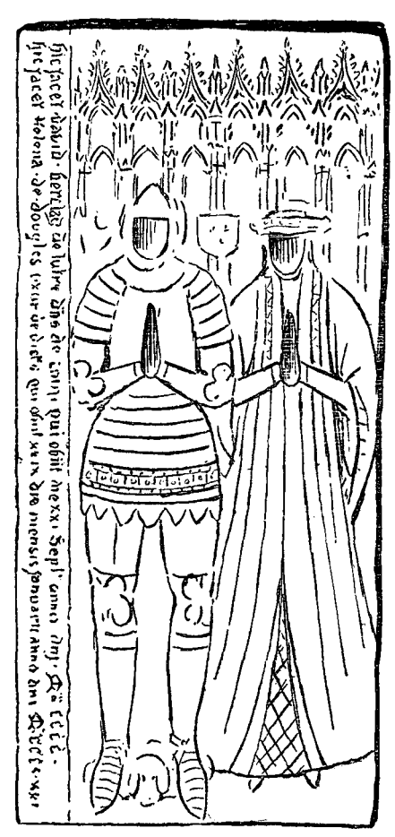
Fig. 2. Incised Sepulchral Slab at Creich, Fifeshire. (17.)

Barclay arms on the keystone, contains a beautiful incised stone slab (fig. 2), with the figures of a knight in armour and his lady, sur-