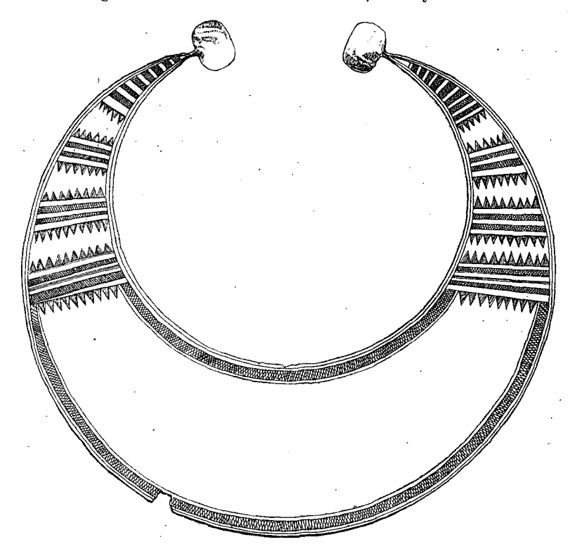
Fig. 2. Gold Lunette from the Lanfine Collection.

Gold Lunette, 9\frac{3}{16} inches in height by 9\frac{1}{2} inches in width, weighing 1055 grains. It is of the usual form, with oval expansions at the ends and is ornamented on both sides with bands of linear ornament, as shown in fig. 2. From the Lanfine Collection, locality unknown.