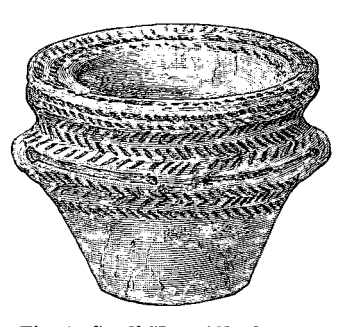
Fig. 1. Small Urn of Food-vessel type found at West Skichen, Carmyllie. (1/2.)