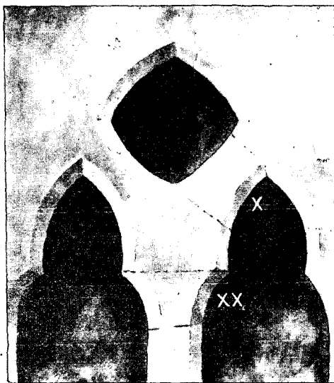
Fig. 2. Sketch showing Window reconstructed.

does within its churchyard. We have had the evidence of Baron Clerk that this area was used as a burial place; Dr Marshall also bears testimony to the same effect; and during the recent excavations the remains of several burials in wooden coffins were found within the enclosed area surrounding the chapel.