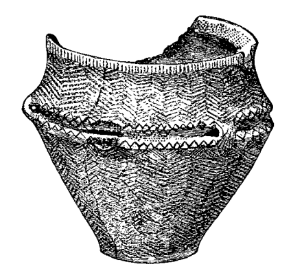
Fig. 1. Urn found at Glenkill, Arran (6 inches in height).

inches diameter. Round the widest part there is a kind of hollow moulding, and across it are placed a series of small loops, six in number, at intervals of about 3\frac{3}{4} inches apart. The whole exterior surface is covered with an impressed decoration of chevrony markings, made apparently with a comb in some parts, and in others with a straightedged implement. The hollow moulding surrounding the widest part of the urn is ornamented on the upper and lower edges with rows of triangular impressions, and the bevelled inside of the lip is covered with markings as of the teeth of a comb. A double row of triangular impressions also appears on the bottom of the urn surrounding the circular margin. This last is a very peculiar feature, ornamentation being very