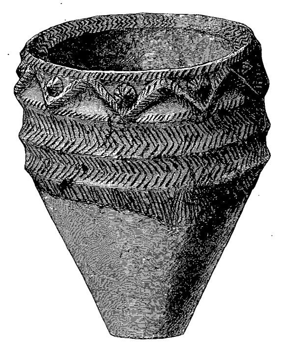
Fig. 2. Urn found at Mid Torrs, Glenluce (12\frac{1}{2} inches diameter).

two encircling ridges—the first, 3\frac{1}{2} inches below the brim, where the diameter is greatest, is sharp, and nearly \frac{3}{8} of an inch high; the second, where the diameter is 10\frac{1}{4} inches, is 3 inches lower down, and is flatter.