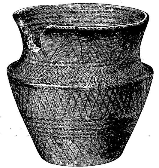
Fig. 7. Urn found at Cairngaan, Kirkmaiden (5 inches in height).

No. 11. By the kind permission of the Council of the Ayrshire and Galloway Archæological Association and of Sir Herbert Maxwell, Bart. of Monreith, I show an engraving from their Collections, vol. v. 45, of a fine "food" urn, 5 \times 4\frac{7}{8} inches, diameter of flat base 2\frac{3}{4} inches. Body flower-pot shaped, contracted sharply at a narrow shoulder to a broad concave collar, widening to the brim. Ornamented nearly all over with encised lines in lozenge and chevron patterns, or encircling corded lines.