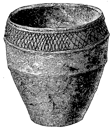
Fig. 5. Urn found at Bankfield, Glenluce (11 inches in height).

No. 5. Cinerary urn of reddish-brown clay, mixed with covered stones. Outline ovoid. Dimensions, 11 \times 10 inches. Brim not truly circular, diameter 10 \times 9 inches. Base flat, diameter 6\frac{1}{2} inches. Ornamented by two low encircling ridges, 2\frac{1}{4} inches apart, and a collar 2\frac{1}{4} inches broad, filled with an irregular lozenge pattern of impressed corded lines, and a similar encircling line close to the rounded brim. The greatest diameter is at the lower ridge, that at the upper being nearly as great.