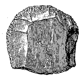
Figs. 1 2. Scrapers of Flint, from Urquhart, Elgiushire (actual size).

One Side Scraper of reddish flint, 2\frac{1}{4} inches in length by 1 inch in breadth, the edge carefully trimmed.