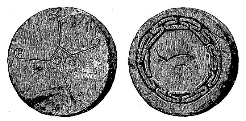
Fig. 1. Carved Disc of Sandstone—Obverse and Reverse (23 inches diameter).

Circular Carved Discs of Stone.—Mr Bruce sends two circular discs of stone (figs. 1 and 2), with curious patterns carved on their surface. These measure 2\frac{3}{4} inches in diameter. They were stated to have been found in