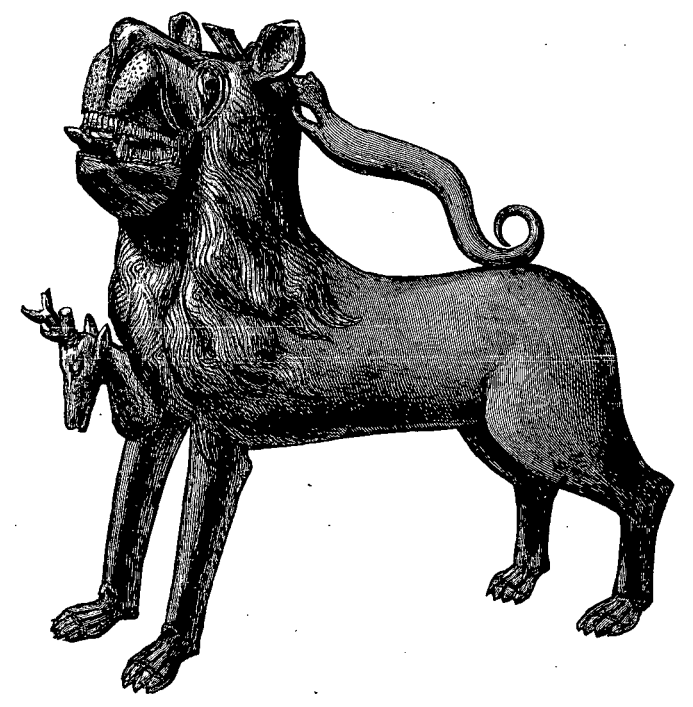
Lion Ewer of Brass, 141 inches high.

48. Lion-shaped Ewer of brass, 12 inches in length and 14\frac{1}{2} inches high, the handle formed in the similitude of an animal, and a stag's head protruding from the breast, between the horns of which is a round opening as if for a spigot, the perforation of which seems not to have been