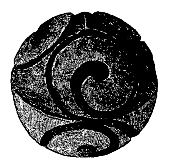
Bronze Ball found at Walston. (Actual size.)

light yellow and the other a dark copper colour. Each hemisphere has three circular discs, formed by incised spirals, the first convolution being almost circular, and then running with a much quicker curve to the centre. In the light-coloured hemisphere the spirals have a peculiar termination, closely resembling the zoomorphic endings of the spiral scrolls of the early Celtic manuscripts. In the dark-coloured hemisphere they terminate in circular endings. No similar example is known.