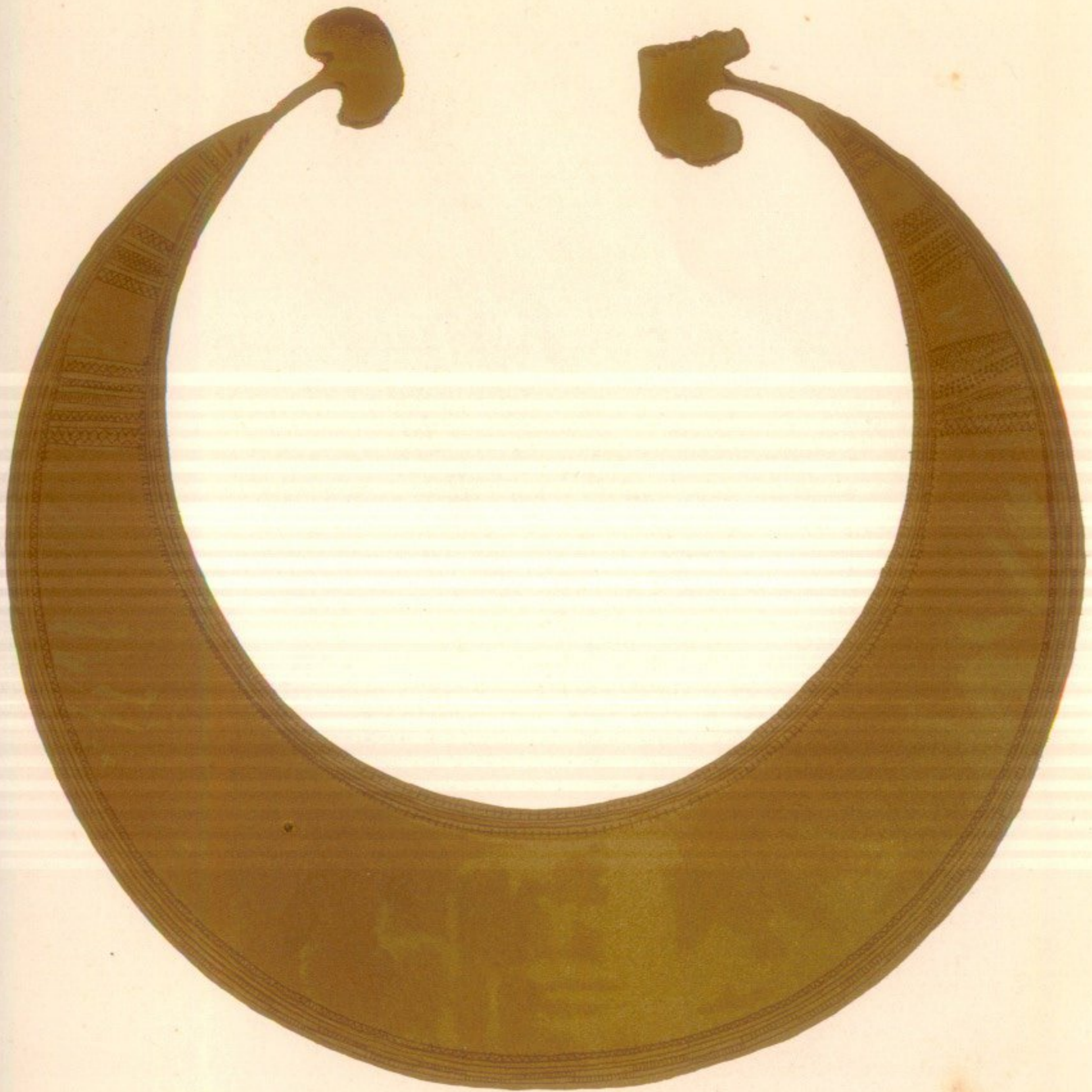
Gold Lunette from Dumfriesshire.