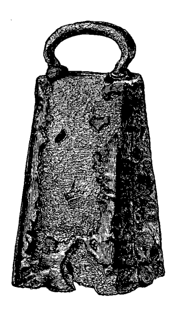
Fig. 1. The Bell of Struan.

Glenlyon, are the only iron bells which remain in the locality where they were used. There are three iron bells of this form in the Museum. One is the bell dug up at Saverough in Orkney, the second (fig. 2) is the bell dug up at Kingoldrum, and the third is the small bell in its elegantly ornamented shrine that was found at Kilmichael Glassary, in Argyllshire.