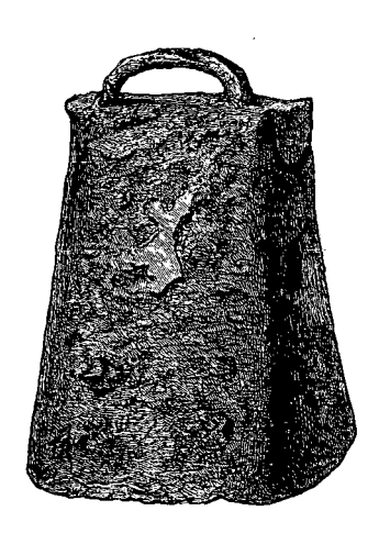
Fig. 2. The Bell of Kingoldrum.