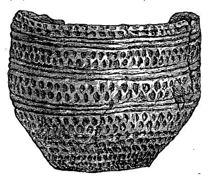
Fig. 1. Urn from Cist at Stannergate (4\frac{1}{2} \text{ inches high}).

In the earth, exactly above the shell-bed, twelve cists were found, eight of which were long cists and four short. All contained bones, but in one only (one of the short cists) was there any other traces of man. This