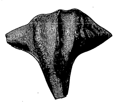
Stone Implement, found in the Broch of Quoyness, Sanday, Orkney (6 inches in greatest length).

Roman Bowl-shaped Vessel or Urn of grey clay, 5 inches in height, partially broken. The lip is everted, and a depressed band, an inch in breadth, runs round the upper part. It was dug up in the Purlieus, near Wandsford, Northamptonshire.