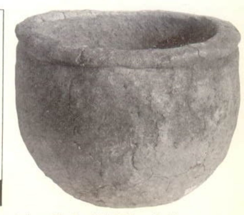
2. Neolithic pot from Roslin, Midlothian (c, \frac{1}{2}) .